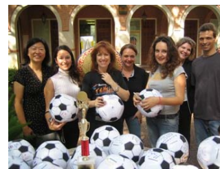
International Education Week

Partner with OISS to support one of our many areas of focus, and ensure the continued success of international students and scholars at Rice University who serve as a vital bridge to cross-cultural understanding.