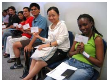
Department of Public Safety