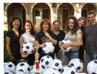
International Education Week

Partner with OISS to support one of our many areas of focus, and ensure the continued success of international students and scholars at Rice University who serve as a vital bridge to cross-cultural understanding.