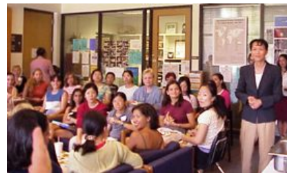
SIR Ladies Luncheon