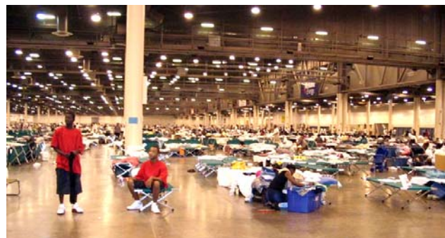
Reliant Center – One of the many Houston shelters to 250,000 Evacuees

International Students & Scholars (OISS) to donate money and sign the banner with their name and country. One postdoctoral researcher from Poland brought in money collected by his three children, apart from his and his wife's donation. Another postdoc from India said that each year in honor of his anniversary, he donates to a charity. He said he did not have to think about what he'd donate to, as this was the perfect opportunity for him.