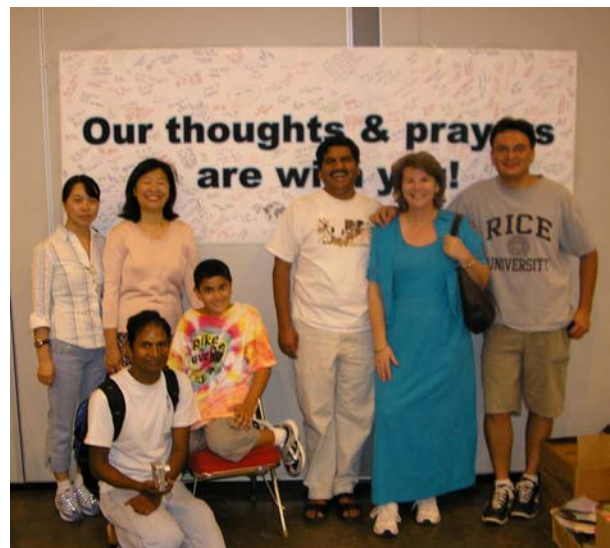
Posting of the banner at Reliant Center

To donate, please visit Compass Bank for matched donations or go to www.redcross.org