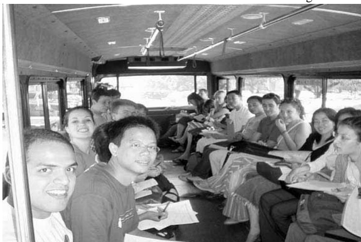
New students are shuttled to Texas Department of Public Safety for IDs