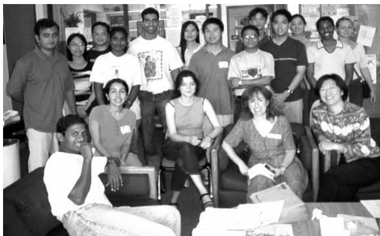
New internationals and volunteers with OISS Staff during O-week

Another great opportunity during the winter break to meet US and international students, experience Christmas holidays with a US family, and visit other US regions is with Christmas International House. Check out the great hospitality and possibilities at www.christmasih.org . The telephone number is: 404-228-7749.